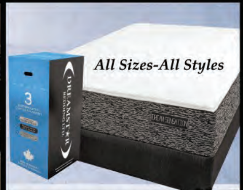
All Sizes-All Styles

MATTRESS IN A BOX from Harris Furniture Cottage Delivery or pick up at the dock