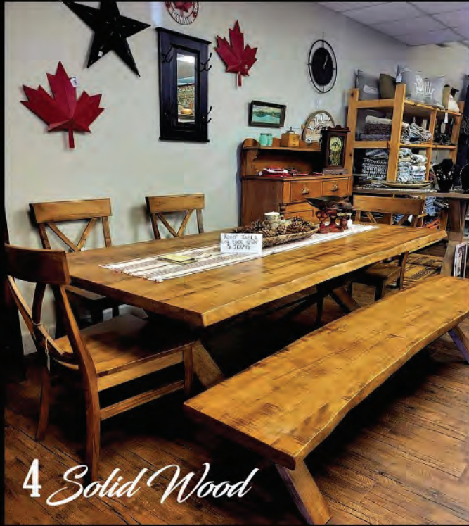
4 Solid Wood