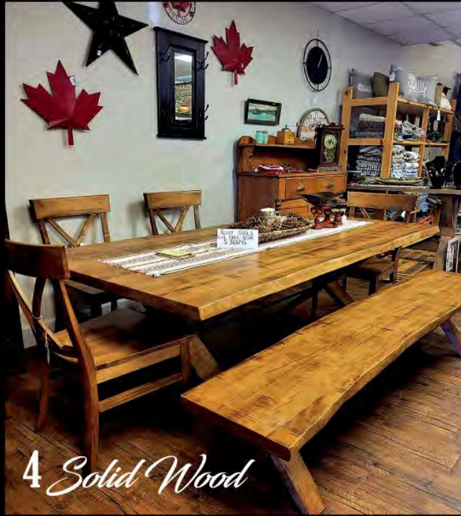
4 Solid Wood