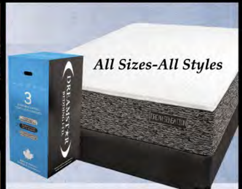
MATTRESS IN A BOX from Harris Furniture Cottage Delivery or pick up at the dock

We are well stocked & Ready to Deliver Furnishings & Cottage Decor. New Styles of Sofa & Sofa beds are in stock along with accent pillows & throws. We offer CANADIAN MADE solid wood beds & suites. If you like solid & safe, you will love our Bunkbeds offered in several styles & colours. "Bed in Box" Made in Canada Mattresses are stocked for easy transportation. Available in all Styles, Sizes & Price Range.